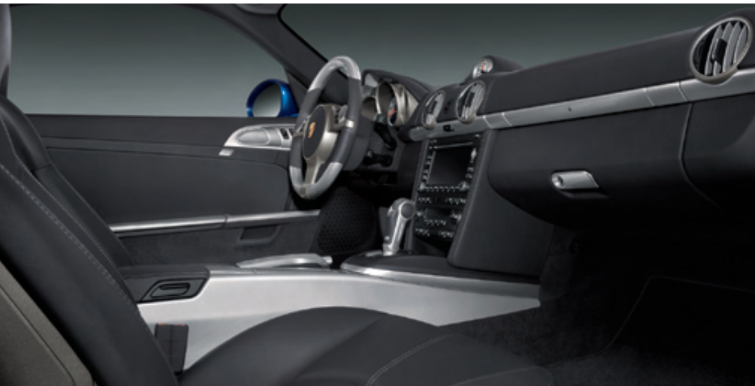
Interior: Aluminium Look