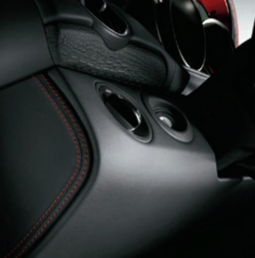
Dashboard end trim in leather from the interior package (A-pillar) in leather