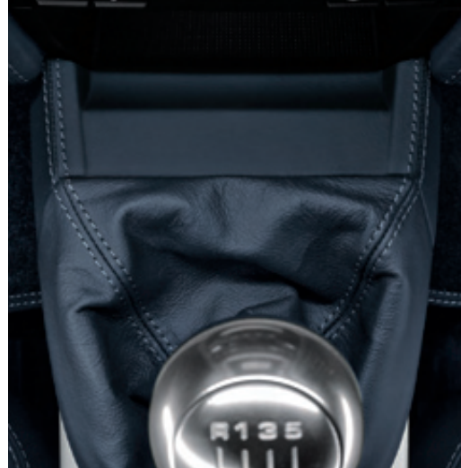
Gear lever trim in leather