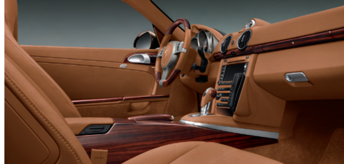
Interior: macassar wood