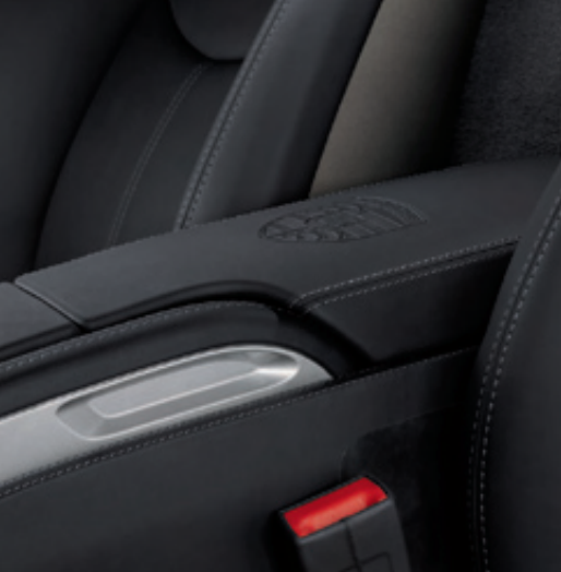
Rear centre console in leather, storage compartment cover with Porsche Crest, seat belt buckles in leather