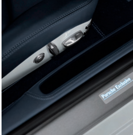
Inner door sill guards in leather