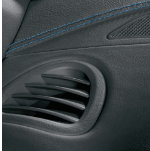
Windscreen defroster panel and defroster vents in leather