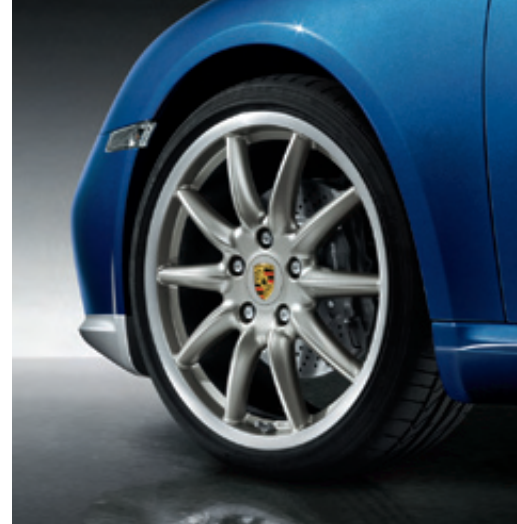
19-inch Carrera Sport wheel