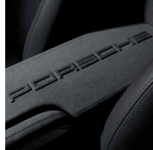
Storage compartment cover in Alcantara with Porsche logo