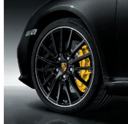
Wheels painted in exterior colour