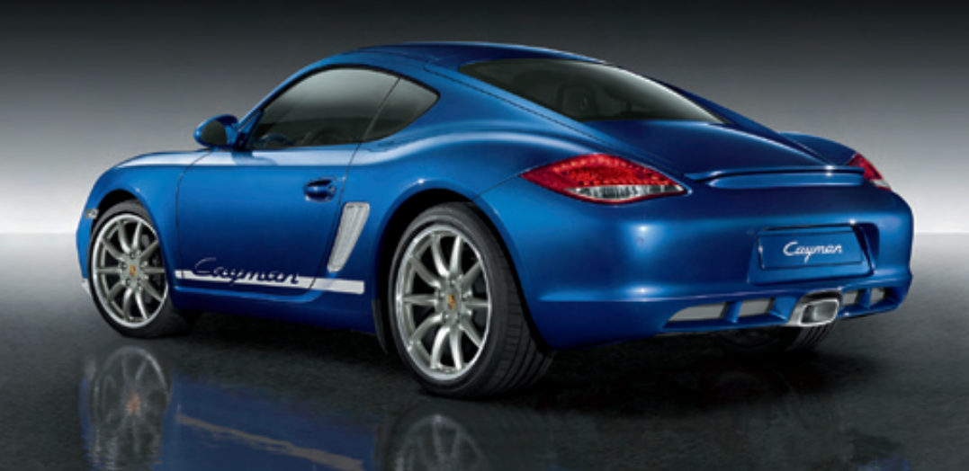
Exterior package in matt Aluminium Look, mirror attachment point finishers painted, rear apron grilles, decorative side logo