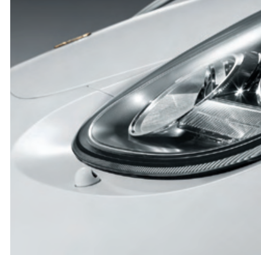
Headlight cleaning system cover painted