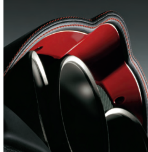
Instrument cluster surround painted