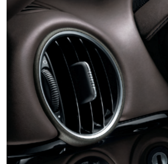
Air vent slats painted