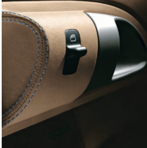
Extended trim package door release lever panel in leather