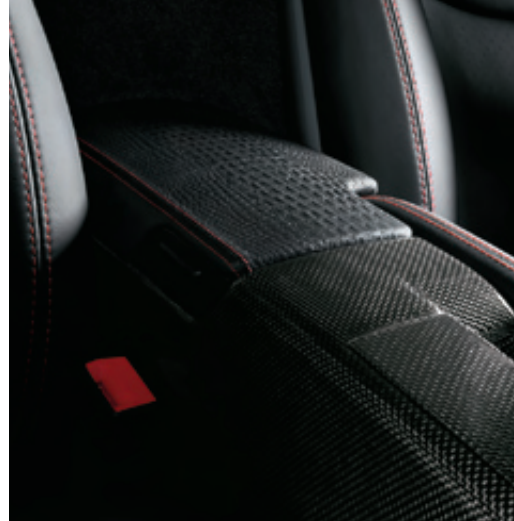
Interior package in leather with exclusive Cayman design