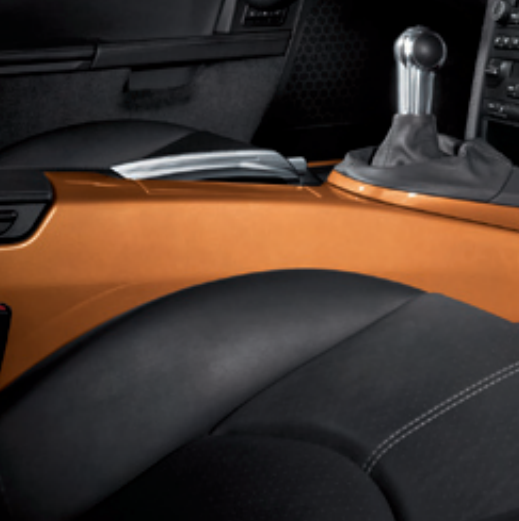
Rear centre console painted