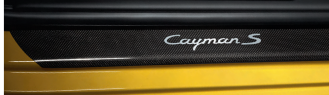
Door sill guards in carbon