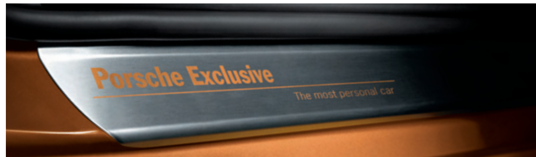
Door sill guards with personalised logo in stainless steel with logo in Nordic Gold Metallic