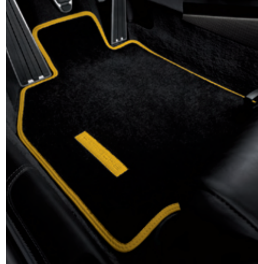
Personalised floor mats with leather surround