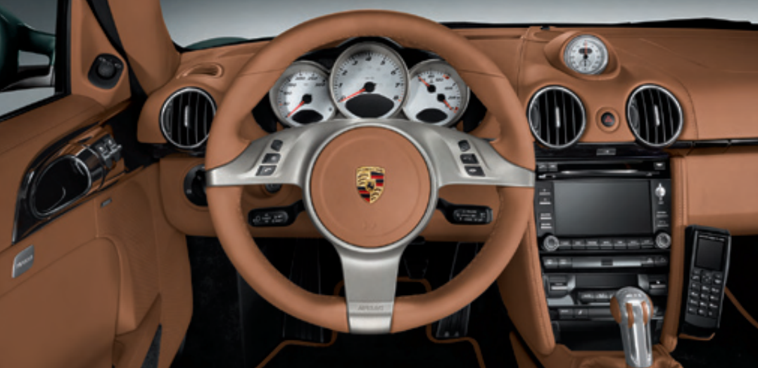
Door release lever panels and door release levers painted black, instrument cluster surround painted black, switch panel trim strip painted black, PCM package painted black