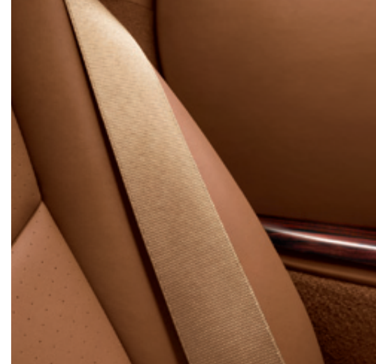
Seat belts in Sand Beige