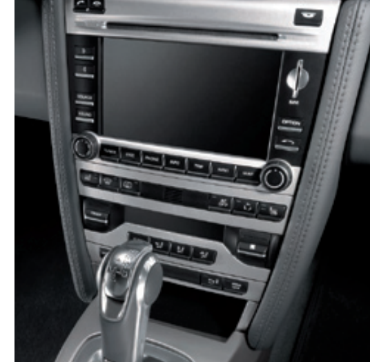
PCM package in Aluminium Look, PDK gear selector gate surround in Aluminium Look