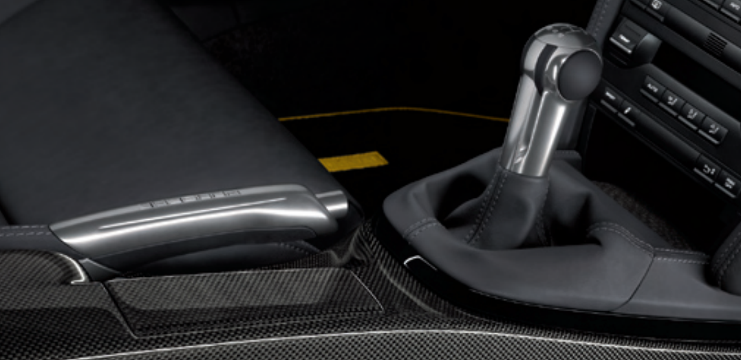
Gear/handbrake levers in aluminium I