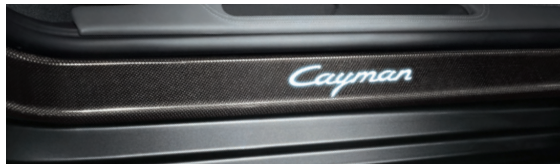
Door sill guards in carbon, illuminated