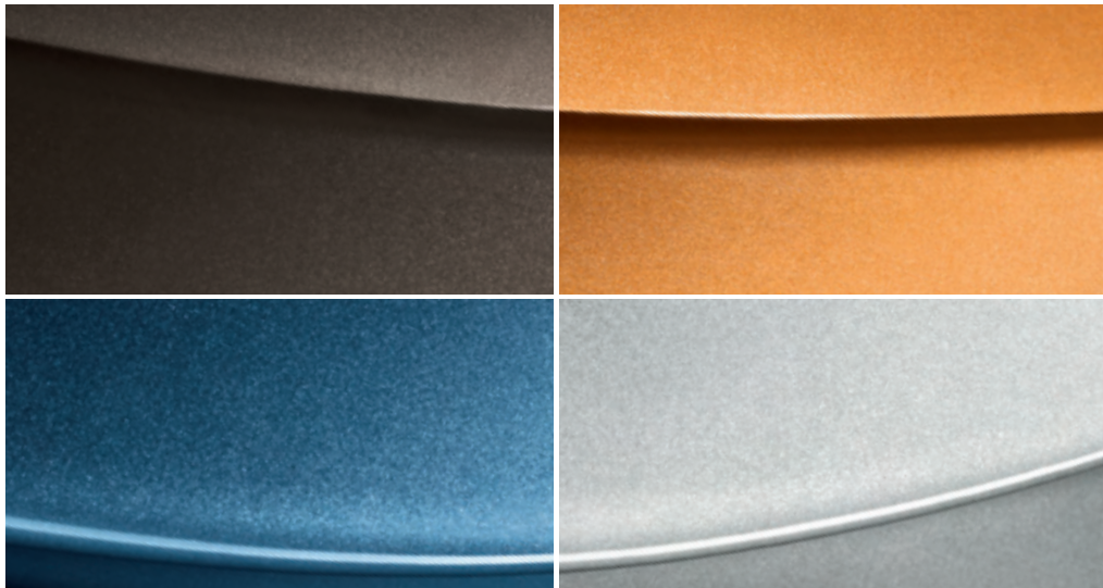
Selection of special/individual colours: Marrone Metallic, Nordic Gold Metallic, Azurro California Metallic, Polar Silver Metallic

We can offer an exclusive range of colours and materials for you to choose from when designing your new Porsche – both inside and outside. Individual colours for the interior and exterior and also high-quality materials such as leather, Alcantara, fine macassar wood 1) , carbon, aluminium and stainless steel to enhance the interior. You can find out what is possible at your Porsche Centre. Or contact the Porsche Exclusive Customer Centre in Zuffenhausen directly for an individual consultation (see page 44).