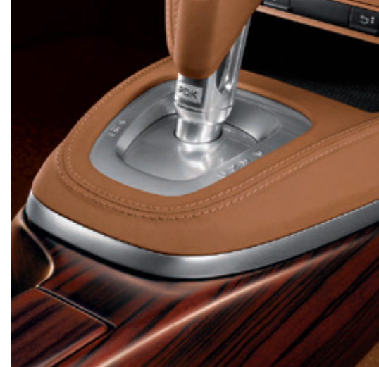
PDK gear selector gate surround in leather