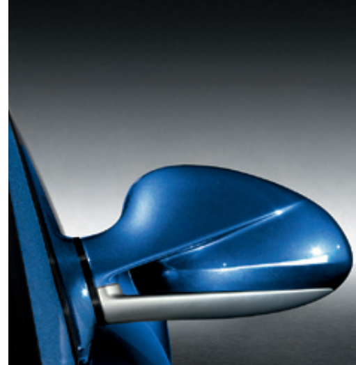
Exterior mirror casings in matt Aluminium Look