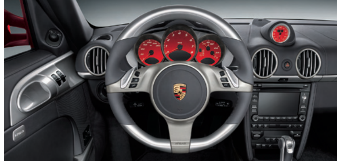
Extended trim package, three-spoke multifunction steering wheel, instrument cluster surround, switch panel trim strip and air vent slats in Aluminium Look, instrument dials and Sport Chrono stop clock instrument dial in Guards Red