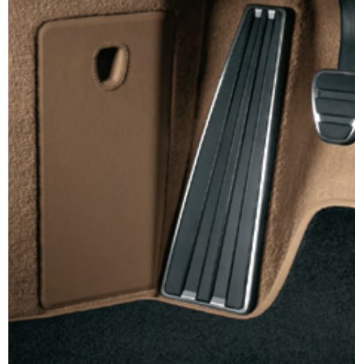
Fuse box cover in leather, sports-style footrest