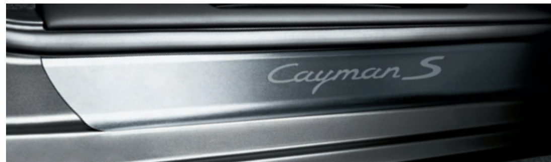
Door sill guards in stainless steel