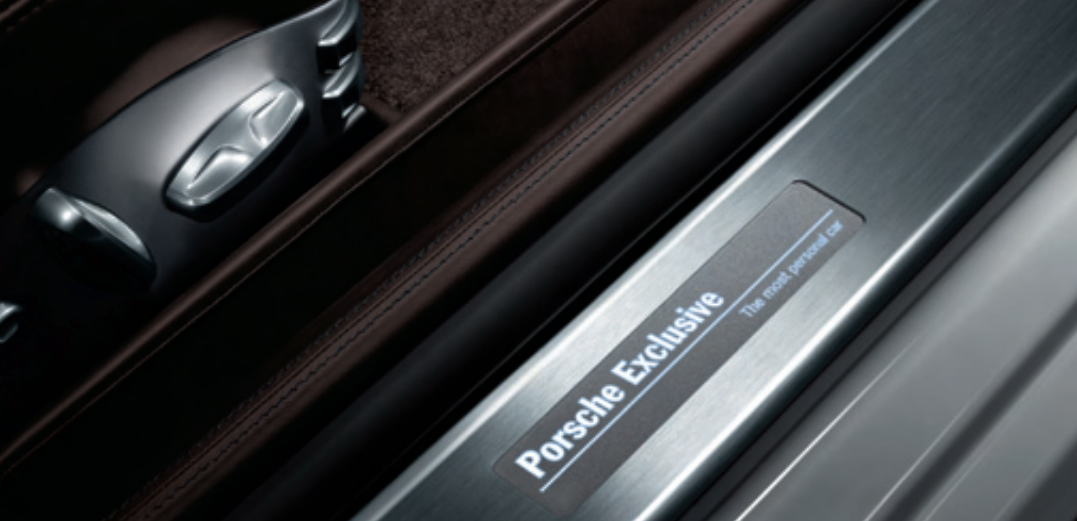
Door sill guards with personalised logo in stainless steel, illuminated